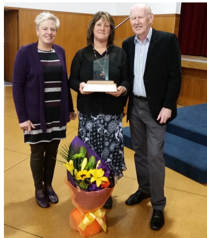
PIOPIO COMMUNITY SWIMMING POOLS CHARITABLE TRUST

Future plans hope to be known shortly, meanwhile the trust group will continue to aim for the longevity of the pools to be retained as a recreational asset for both schools, sports clubs and public swimming.